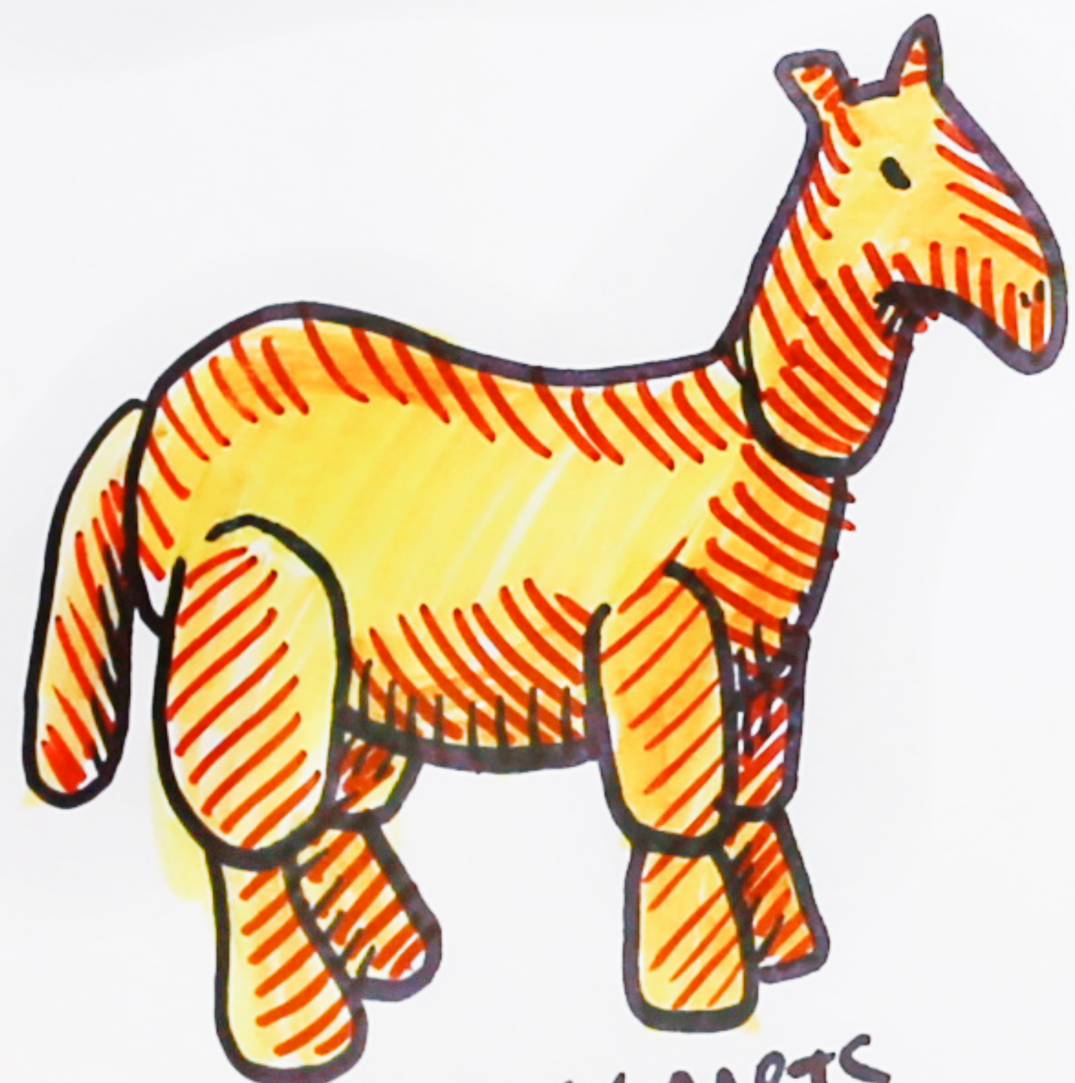
MADE OF MANY PARTS