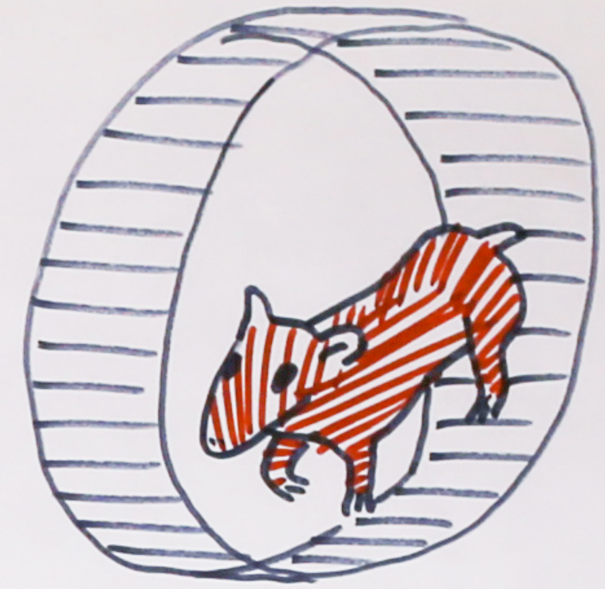
HAMSTER WHEEL OF DESPAIR