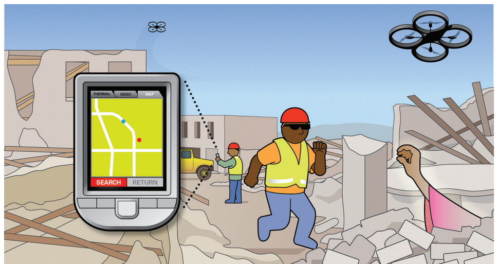
An earthquake has hit a large city, and search-and-rescue crews are looking for survivors. Resources are scarce, including human crews, and help is needed to locate potential survivors quickly.

The SEI seeks to improve information capture and display for warfighters and first responders using new generations of handheld devices (such as smartphones or small tablets) in hostile or crisis situations.