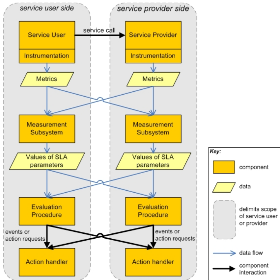
Figure 1: Conceptual Architecture for SLA Monitoring and Management (adapted from the work of Ludwig and colleagues [Ludwig 2003])

The evaluation procedure checks the values against the guaranteed conditions (i.e., the service level objectives) of the SLA. If any value violates a condition in the SLA, predefined actions are invoked. Action-handler components are responsible for processing each action request. While the functionality they execute will vary, it will likely include some form of violation notification or recording. Action handlers may exist on the service user machine, service provider machine, and/or third-party machines.